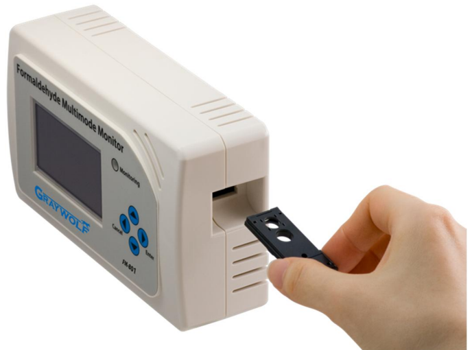
Inserting a reusable cartridge into the FM-801

The FM-801, along with all GrayWolf units for a wide variety of parameters, are available for rental as well as purchase. The FM-801 is able to work as a stand-alone monitor, with logged data downloaded to GrayWolf's WolfSense PC data transfer and reporting software. The FM-801 may also be interfaced to other GrayWolf equipment for simultaneous display, logging and remote on-line access of multiple parameters.